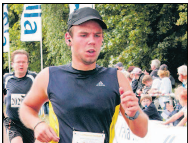
Andreas Lubitz competes in a race in Hamburg, Germany, in 2009. The airline pilot appears to have hidden evidence of an illness from his employers.

A student at Duke University SEE FRAT — A4