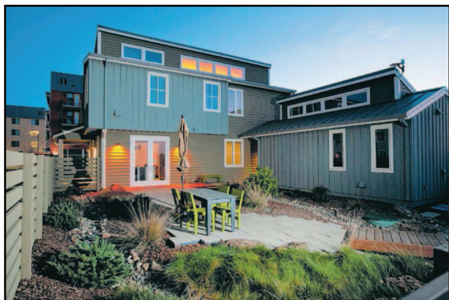
The house is programmed to put itself to sleep at bedtime by closing the blinds and adjusting the lighting